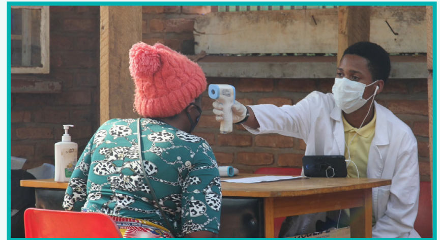
UK Aid Match grant holder EMMS International

“MannionDaniels is at the forefront of this, directly working with organisations to allow them to learn from each other’s past and current experiences to drive greater resilience and sustainability for the future”